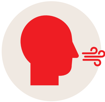
ABNORMAL, SLOW, OR NO BREATHING

Learn to recognize signs and symptoms that may indicate an opioid poisoning. Not all of these symptoms may be present.