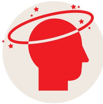
EXTREME DROWSINESS OR UNRESPONSIVENESS