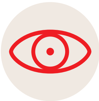
SMALL OR PINPOINT PUPILS