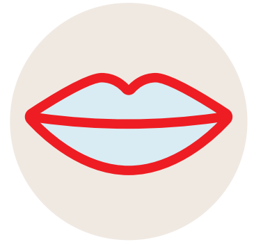
PALE OR BLUE/GREY SKIN OR LIPS